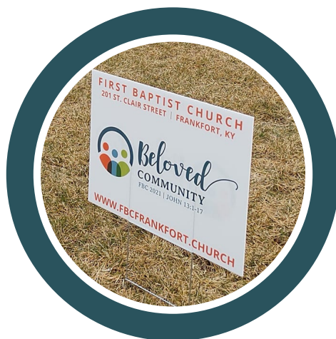
Photo op! Send a photo of your family in your yard with your yard sign to Kara. You might just see yourself in an FBC publication or social media post!

We hope you will pick up a sign from the front lobby closet this year. A $10 donation per sign is suggested to help cover costs but is certainly not required. If you cannot get a sign but would like one, please call the church and we will deliver one for you.